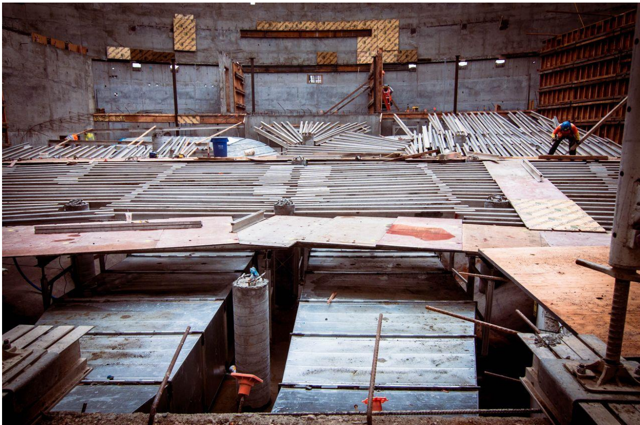
Shoring for elevated concrete slab for future audience seating. Duct work in foreground.

Structural Steel – Installation of the balcony steel is scheduled to begin on March 18 th , followed by the lobby and auditorium roof steel. Structural steel installation will continue through May.