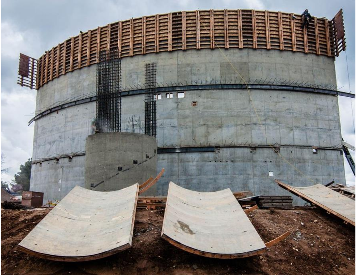
Elevator tower and auditorium. Elevator tower forms in foreground.