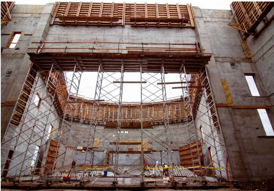
Interior of stage looking toward audience.