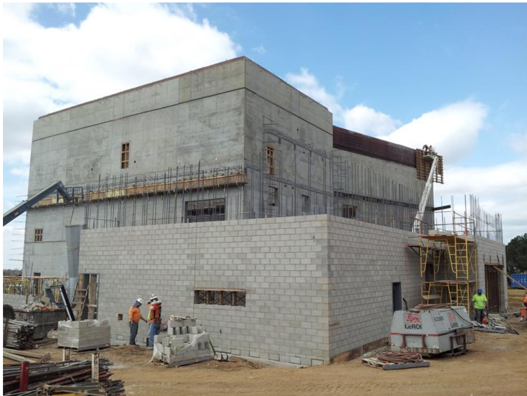
Electric and Multi-Purpose Rooms (foreground). Stage and Auditorium (background).